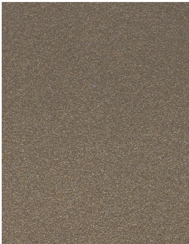
HF80 Fenix Bronzo 2629