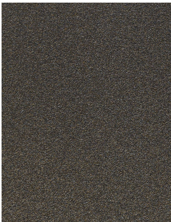
HF70 Fenix Piombo 2630