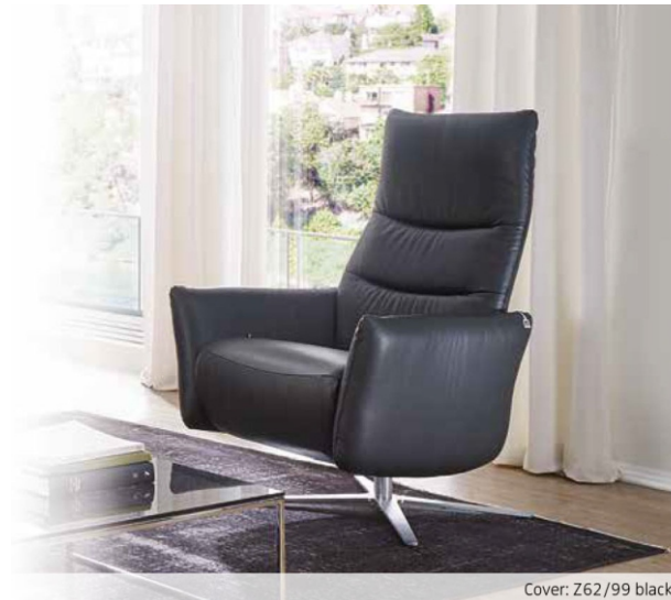
Cover: Z62/99 black