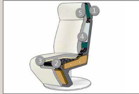
The design of the cross section shown here does not correspond to the model on this page of the catalogue.