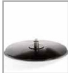
wooden base - diff. stain shades - FU 3., surcharge F U3.