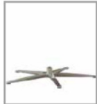
five spoke metal leg high-gloss chrome - FU 1 F U1