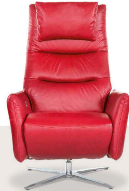
Cover: Z62/14 rosso

This chair is a highlight in each room due to its quilted back. At first sight you will not notice something special – but once you sit down you will discover the back and armpart function which gives you a perfect comfort feeling as an option. The noble swivel base is available in different metal colours.