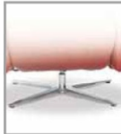
cross metal leg, nickel glazed steel - FU 4., surcharge F U4.