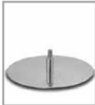
turntable leg - diff. metal colours - FU 2., surcharge F U2.