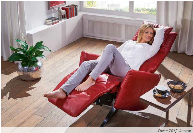
Cover: Z62/14 rosso