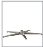
5-spoke base diff. metal col. 3 seat heights F U1