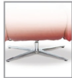
4-spoke leg, surcharge 3 seat heights F U4.

Metal colours: Some of the metal legs are available in different metal colours. Please indicate the colour when ordering.