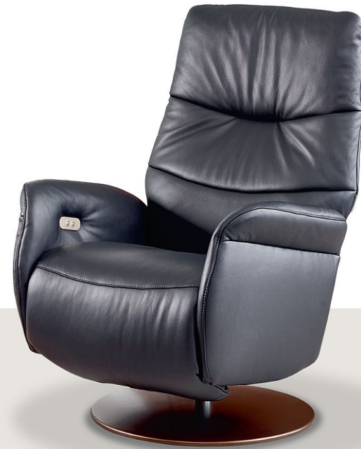
Cover: Z73/99 black

[Model L] can be ergonomically adjusted manually or electrically and transformed into a super comfortable relax armchair . Different legs are available in several metal tones .