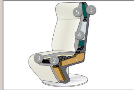
The design of the cross section shown here does not correspond to the model on this page of the catalogue.