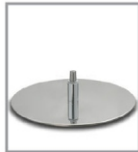
Metal base diff. metal col. surcharge 3 seat heights F U2.