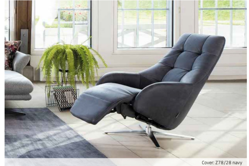
Cover: Z78/28 navy