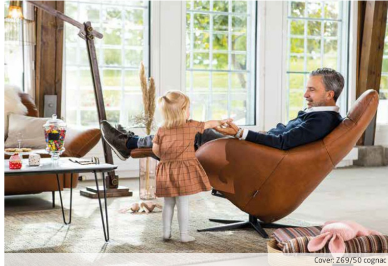
Cover: Z69/50 cognac