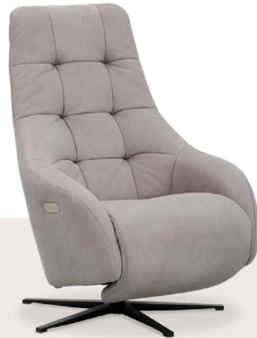
Cover: Z78/21 steel

Striking topstitching in the back is the trademark of [Model F]. The Seat and back of the swivel-leg executive chair can be adjusted by motor at the touch of a button . Battery operation is also available at extra cost. The headrest is infinitely adjustable and the 4- and 5-star legs are available in various metallic shades. A contrasting colour thread can be ordered in the leather version.