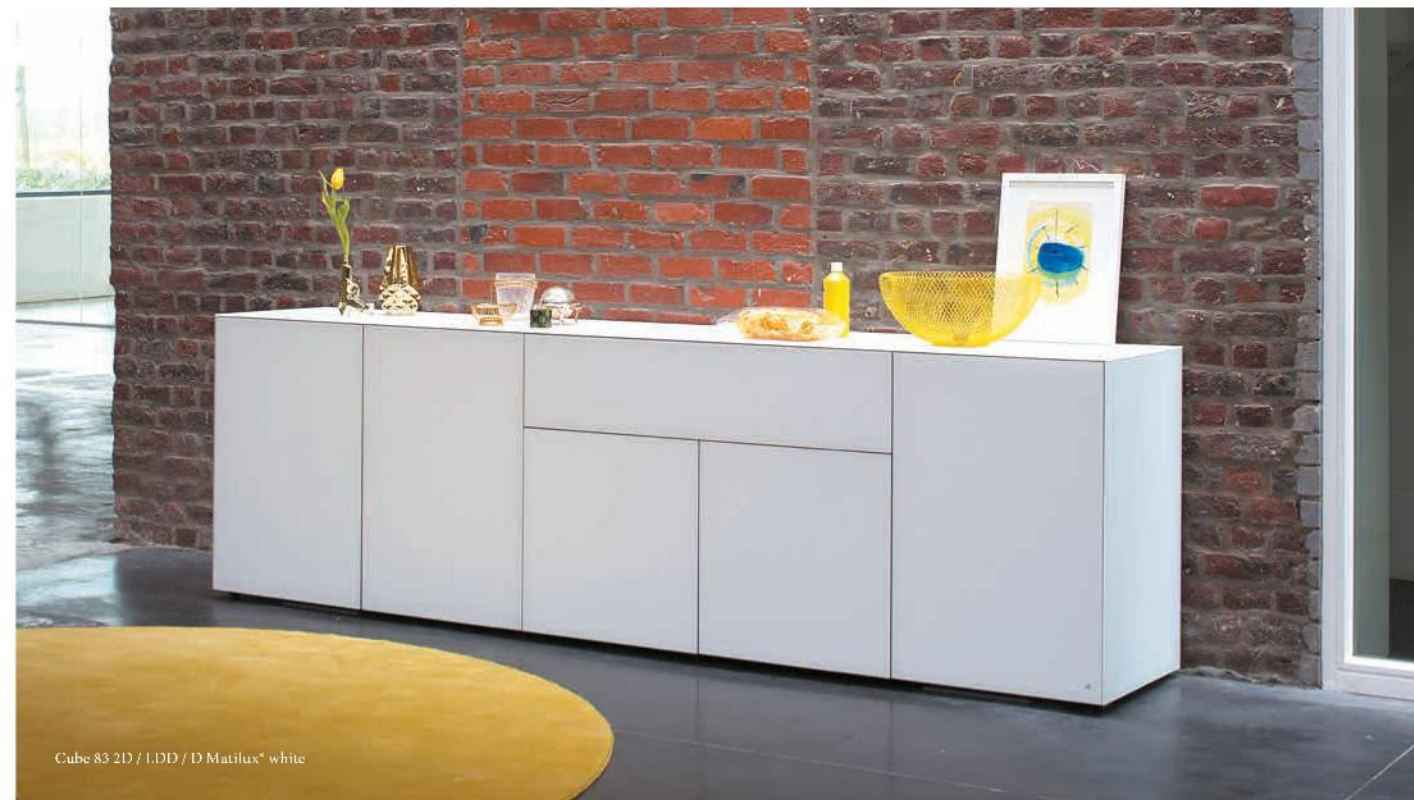
Cube 83 2D / LDD / D Matilux® white