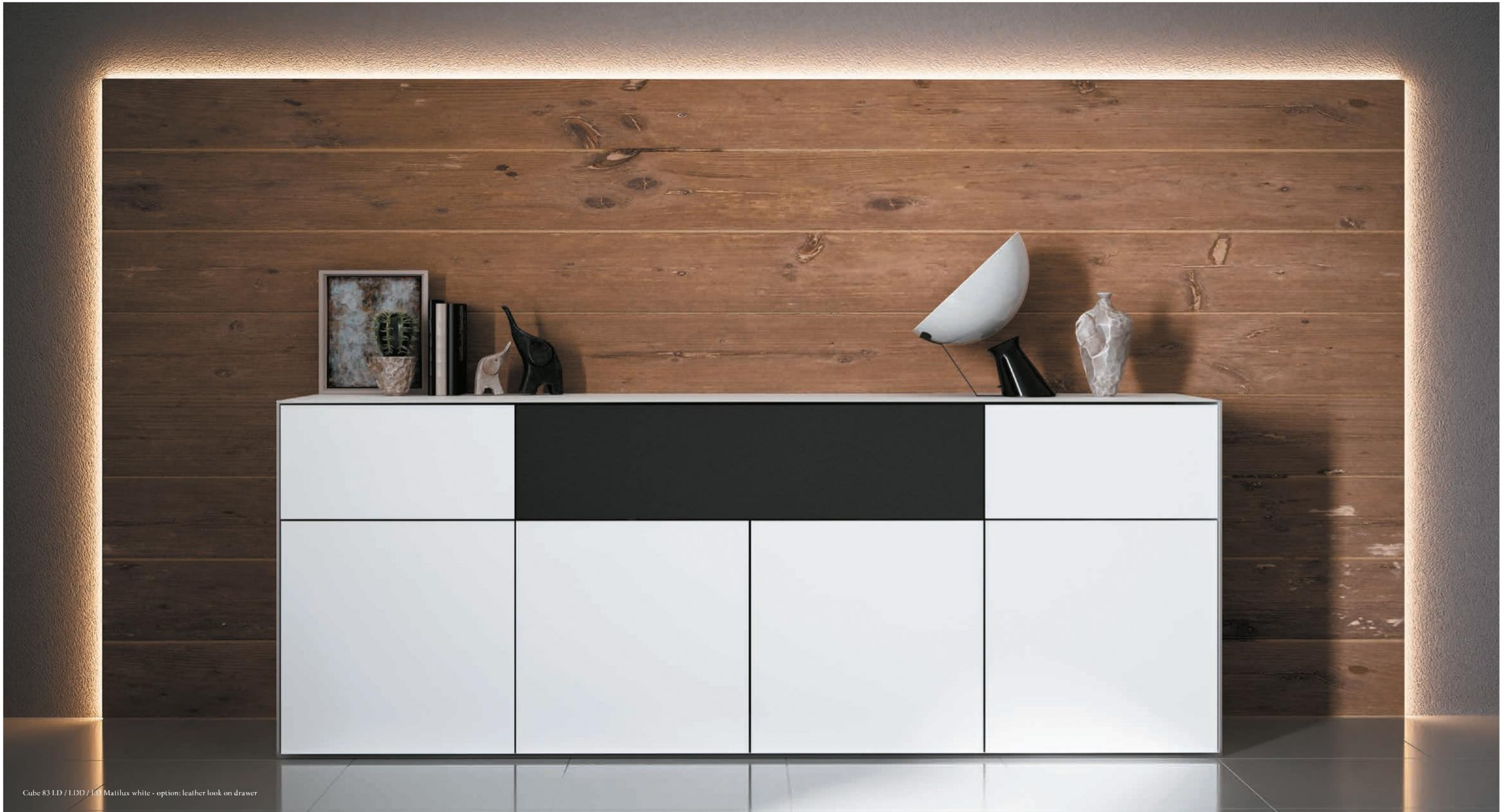
Cube 83 1.D / 1.DD / 1.D Matilux white - option: leather look on drawer

Check the Joli configurator http://configurator.joli.be/configurator