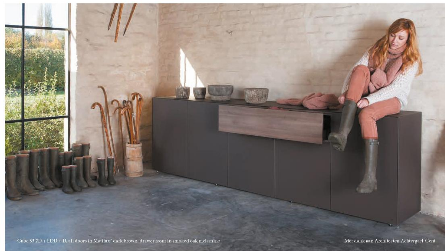
Cube 83 2D + LDD + D, all doors in Matilux® dark brown, drawer front in smoked oak melamine