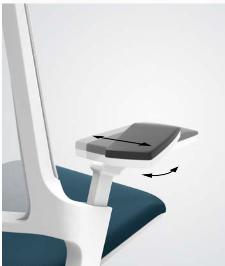
3D T-armrests (height and width-adjustable, can be swivelled)