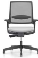
Swivel chair mesh back, upholstered seat

with synchronous mechanism and weight regulation