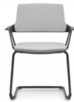
Conference chair, upholstered