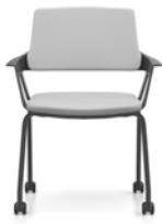
Conference chair, upholstered