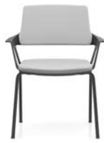
Conference chair, upholstered