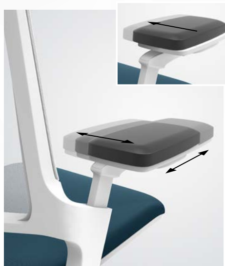
3D T-armrests (height, width and depth-adjustable)

Armrests: optional adjustable armrests are comfortable and relieve strain on arms and shoulders.