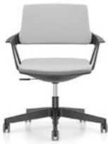
Conference chair, upholstered