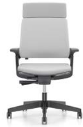
Swivel armchair, upholstered

with synchronous mechanism and weight regulation