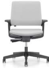
Swivel chair, upholstered