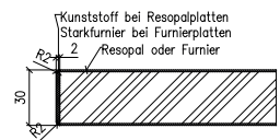
Table top R: 30 mm thick, 28 mm strong multi-layered plywood, surface coated in high-pressure laminate (HPL) or veneer according to BRUNE® collection. Lower surface: HPL white or beech veneer. Edges multi-layered plywood, straight edges, 9 mm thick, beveled over 35 mm.

Table top C: 30 mm thick, multi-layer particle board, E1, coated in high pressure laminate (HPL) or veneer according to BRUNE® collection. Plate bottom side HPL white or beech veneer. ABS edging in connection with laminated top or veneer edging in combination with veneered table top.