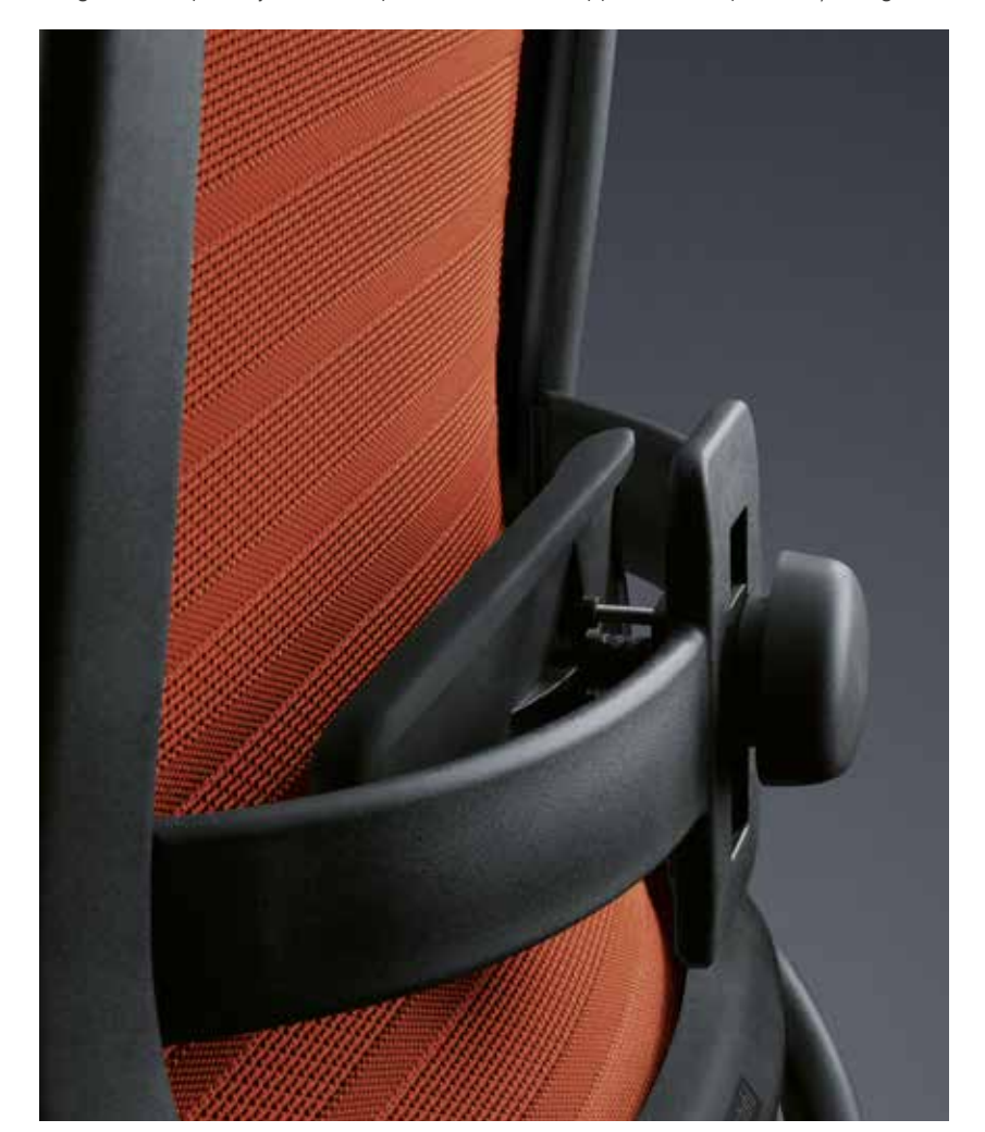
Height and depth adjustable mechanical lumbar support in the mesh design.