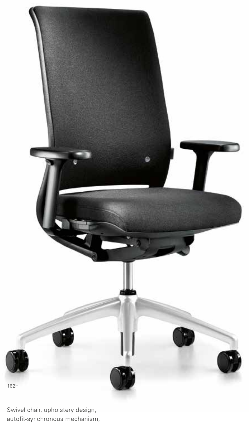
Swivel chair, upholstery design, autofit-synchronous mechanism, 4D T-armrests (optional), air-pressure lumbar support (optional), brilliant silver aluminium base (optional)