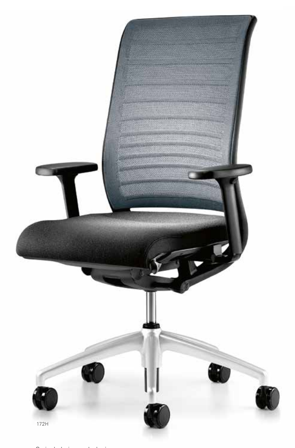
Swivel chair, mesh design, autofit-synchronous mechanism, 4D T-armrests (optional), seat depth adjustment astiv (optional), brilliant silver aluminium base (optional)