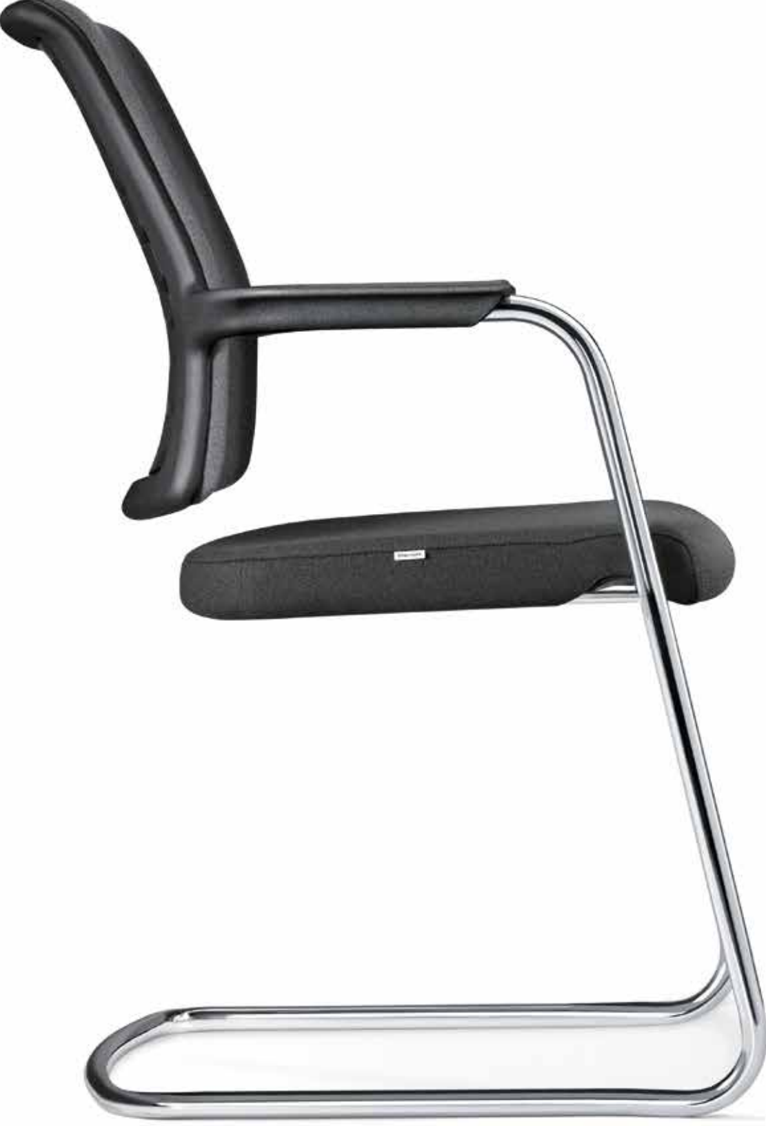
Cantilever frame, upholstered back, with arm pad, stackable