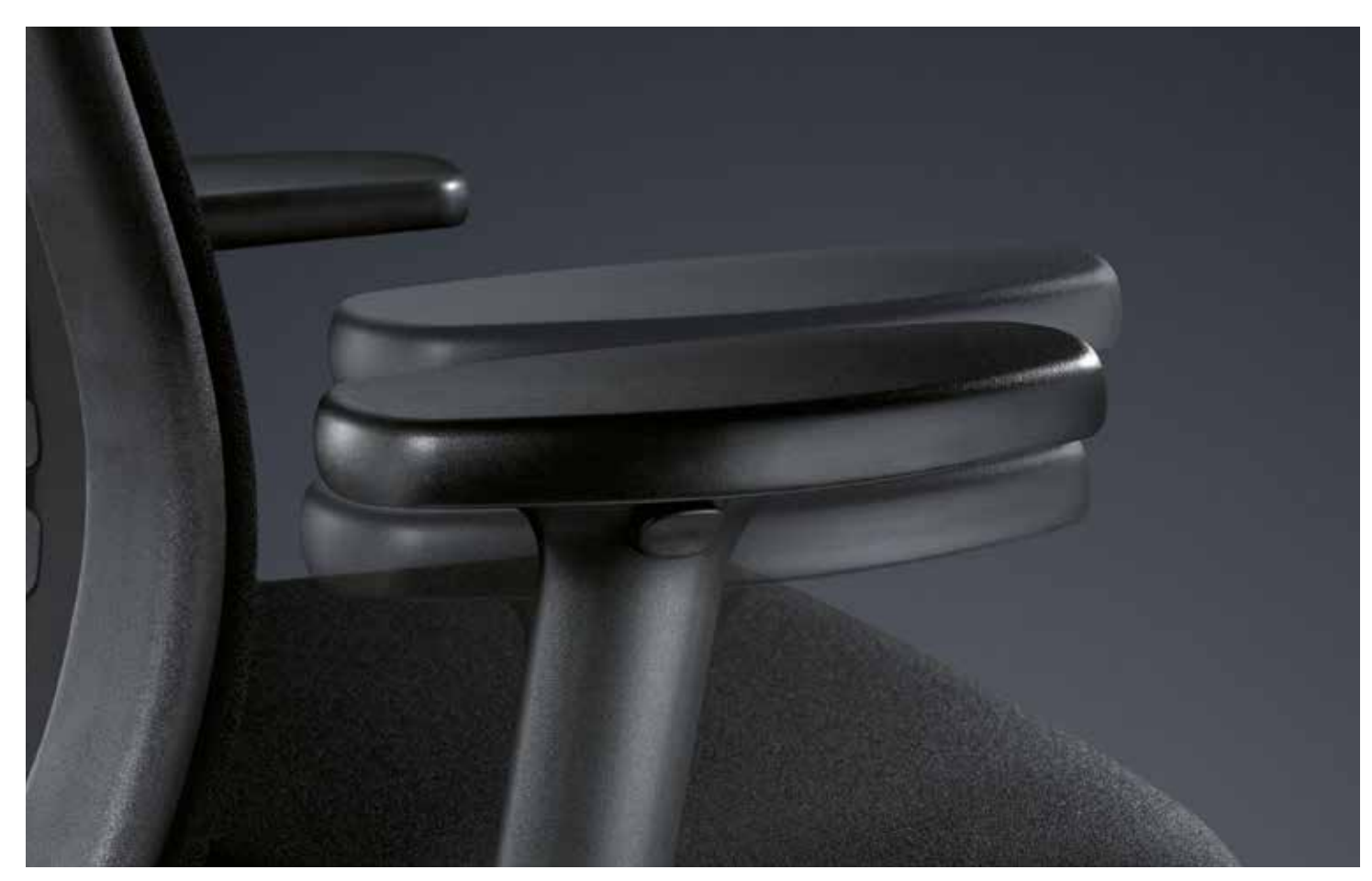
T-armrests, 4D adjustable in height, width and depth, rotatable.