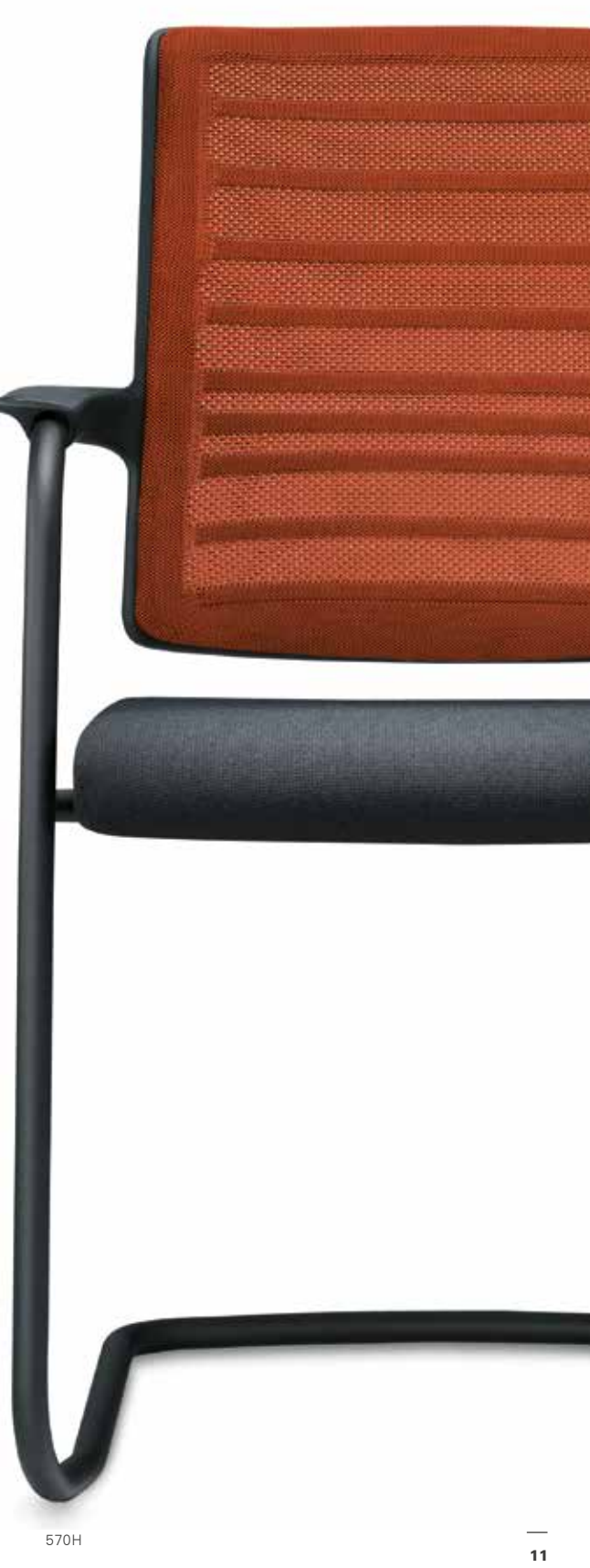
Cantilever frame, mesh covered back, with arm pad, stackable

Cantilever frame, mesh covered back, with arm pad