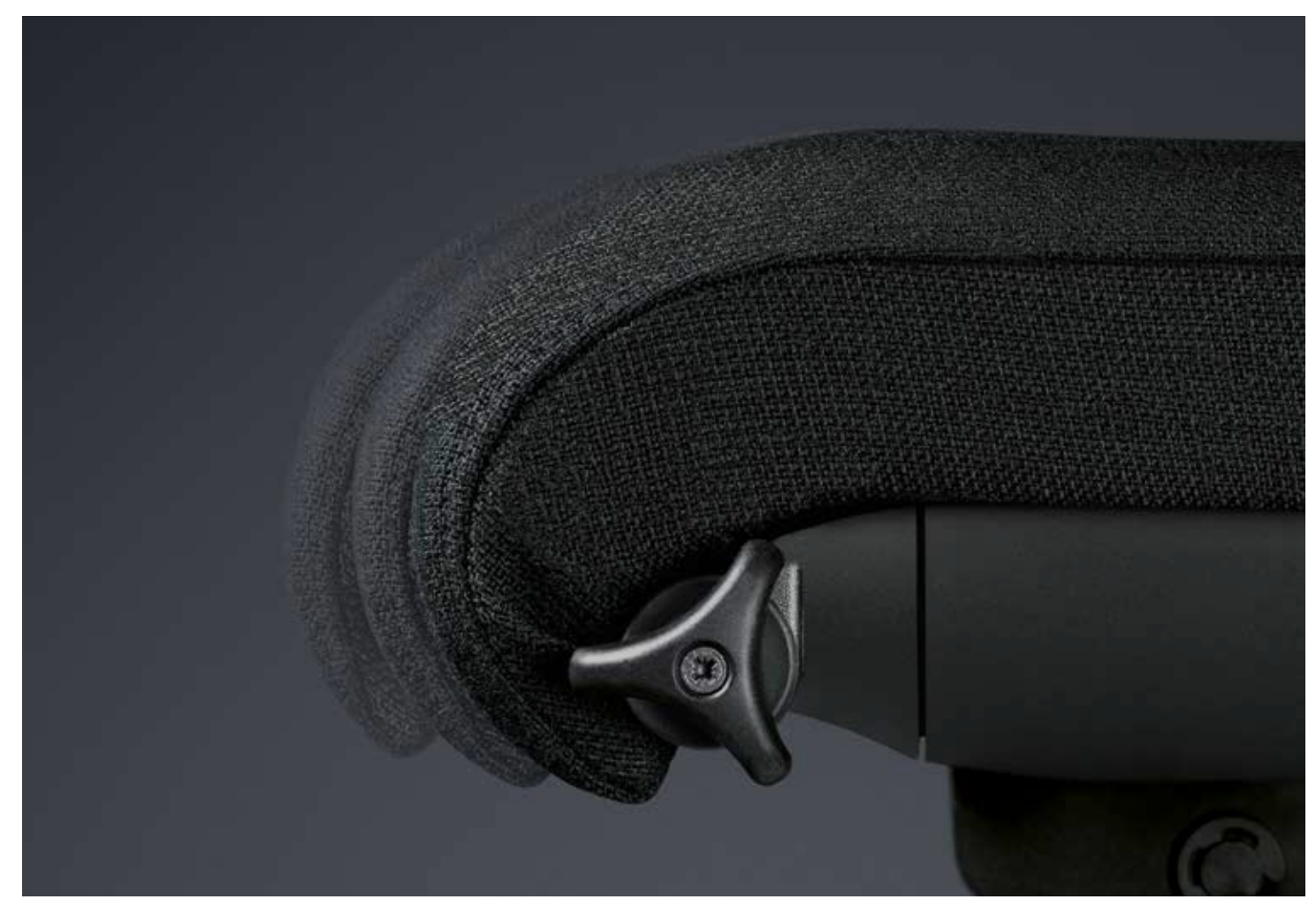
The astiv seat depth adjustment effectively extends the seating area and thus the seating area for the thighs. The base of the backrest remains unaffected.