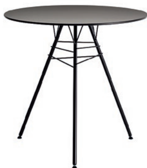
Table with steel base and top made of HPL, available in the round or triangular with rounded edges versions. Painted base available in white, moka and green, while top is only available in dark grey. Suitable for outdoor use. Height 74 cm.

Art. 1814: Table with steel base and round top made of HPL