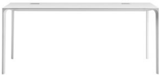
Table with rectangular top equipped with grommets to be completed with cable grommet code 0811 and/or grommet cover code 0821, suitable to be fitted with office accessories. Tops are available in MDF laminate or wood veneered, with polished or painted aluminum frame.

Art. 0818: 80 x 160 cm rectangular top - 31 1/8" x 63" Art. 0815: 80 x 180 cm rectangular top - 31 1/8" x 70 7/8" Art. 0817: 100 x 200 cm rectangular top - 39 3/8" x 78 3/4"