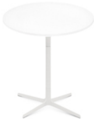
Table with polished or painted aluminum structure and round or square polypropylene top available in white, black or grey (also bi-colour). Base fitted with adjustable glides in the same finish as the structure. Height 74 cm - 26 1/8".

Art. 3203: Mdf MD 70 x 70 cm - 27 1/2" x 27 1/2"