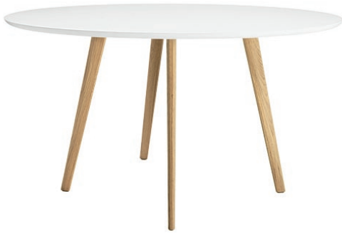
Table with solid natural oak legs and MDF top available in white lacquered or teak-effect wood veneered versions. Only round top version available. Height 74 cm - 29 1/8"

Art. 3500: MDF MD Ø 120 cm - Ø 47 1/4" Art. 3501: MDF MD Ø 134 cm - Ø 52 3/4" Art. 3502: MDF MD Ø 160 cm - Ø 63"