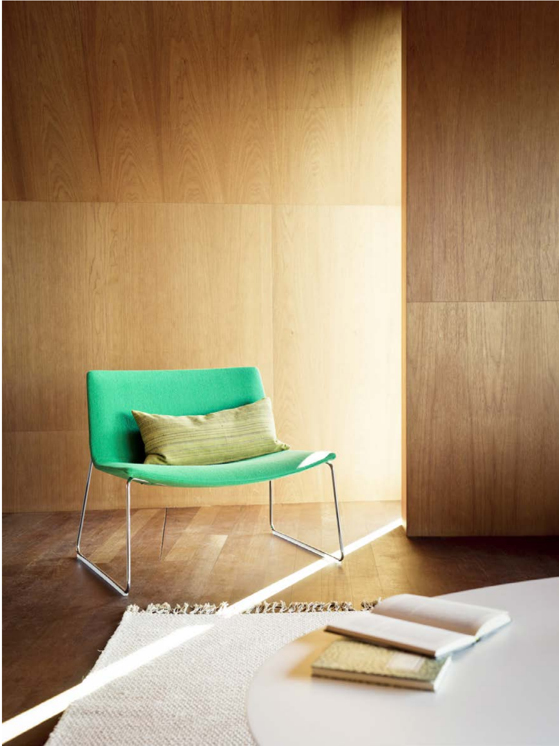
Private residence, Pontevedra, Spain Art. 2010 Chromed steel sled base & fabric upholstered shell.